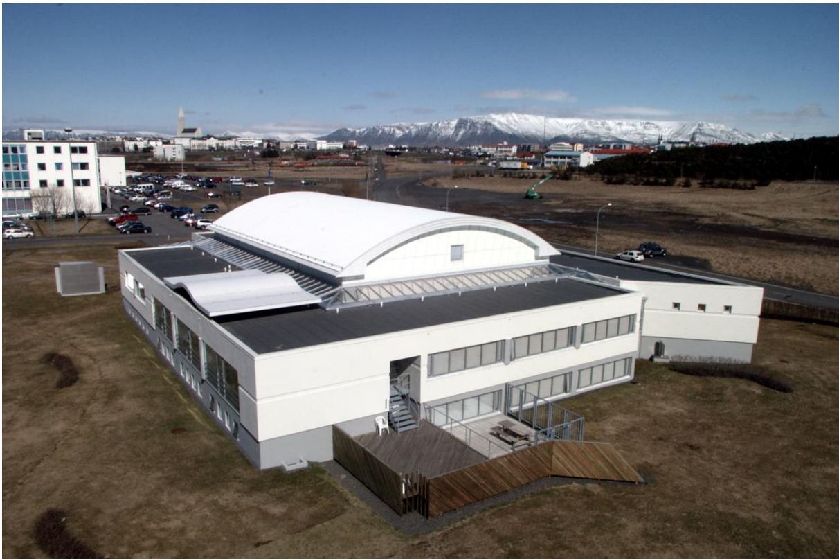
Reykjavik Oceanic Area Control Centre Operations Building